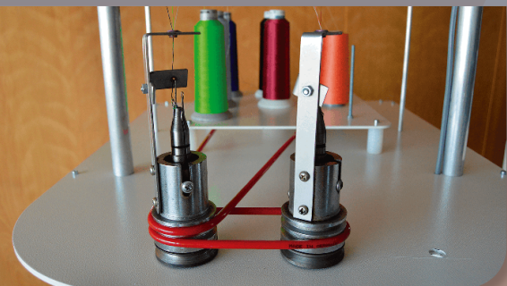
Optionals > 3 rd Head > Counter of Meters