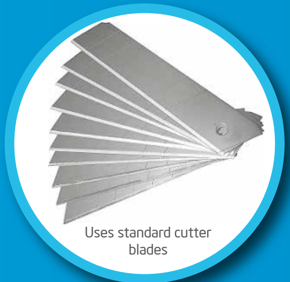
Uses standard cutter blades